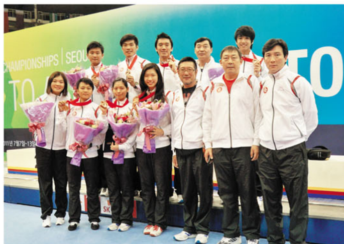
香港劍擊隊 Hong Kong fencing team