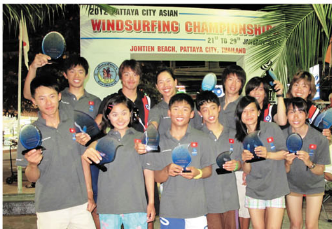
香港滑浪風帆隊 Hong Kong windsurfing team

The junior athletes also excelled at the 6 th Asian Junior Wushu Championships, winning 6 gold, 7 silver and 1 bronze medal, with Chan Cheuk-lam leading the medal tally with 2 individual gold medals in women's 24 forms taijiquan B and 32 forms taijijian B events.