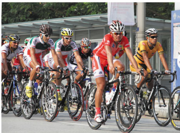
黃金寶 (前, 單車) Wong Kam-po (front, cycling)

The fencing team displayed consistent performance throughout the year. In addition to the medal success of both senior and junior fencers at the 26 th Summer Universiade and the 7 th National Intercity Games, the team delivered solid results in the face of stiff competition from top fencers in the region, winning 4 bronze medals in team events – men's foil, men's sabre, women's epee and women's foil – at the Asian Fencing Championships 2011.