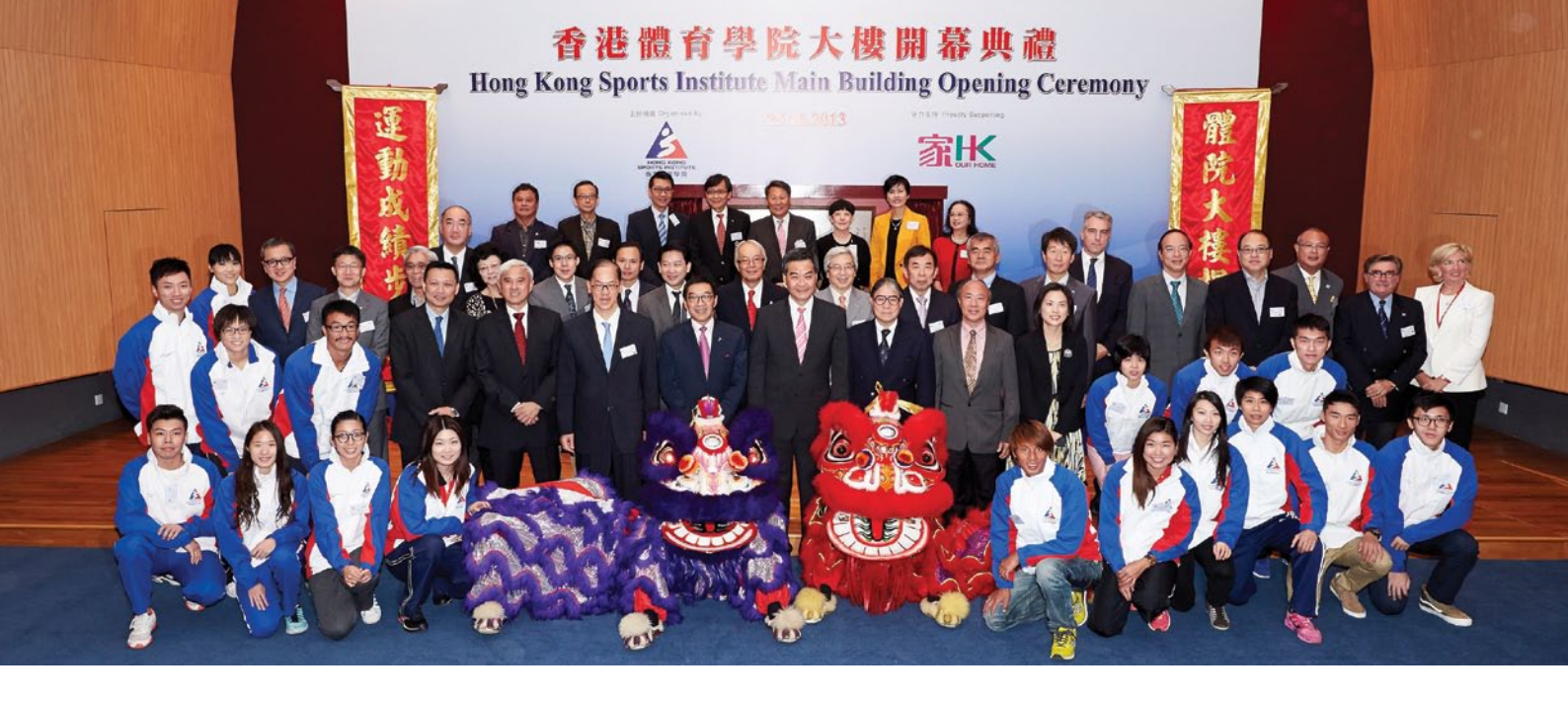
體院承蒙香港特區行政長官梁振英先生擔任新建大樓開幕典禮的主禮嘉實。 The HKSI was honoured to have The Hon C Y Leung, Chief Executive of the HKSAR, officiate the HKSI Main Building Opening Ceremony.

由政府資助18億港元進行的體院重新發展計劃亦踏進多項新里程。在二零一三年六月,賽艇、壁球、保齡球和武術四個精英體育項目慶祝全新訓練設施投入運作,為運動員提供世界水平的訓練環境。此外,體院大樓亦在年內落成,並於二零一三年十月舉行開幕典禮,承蒙香港特別行政區行政長官梁振英先生擔任主禮嘉賓。