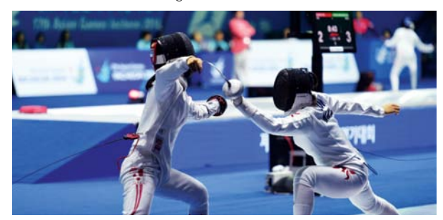
劍擊隊在三個劍種項目奪得共8面銅牌。 The fencing team won a total of 8 bronze medals in all three fencing disciplines.