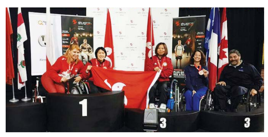
香港輪椅劍擊隊揚威國際體壇。 The Hong Kong wheelchair fencing team performed outstandingly in the international sporting arena.