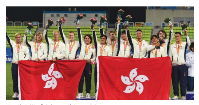
男子欖球隊為港奪得一面隊際項目獎牌。 The men's rugby team brought home a team sport medal for Hong Kong.