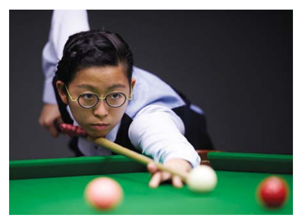
吳安儀 (桌球) Ng On-yee (billiard sports)